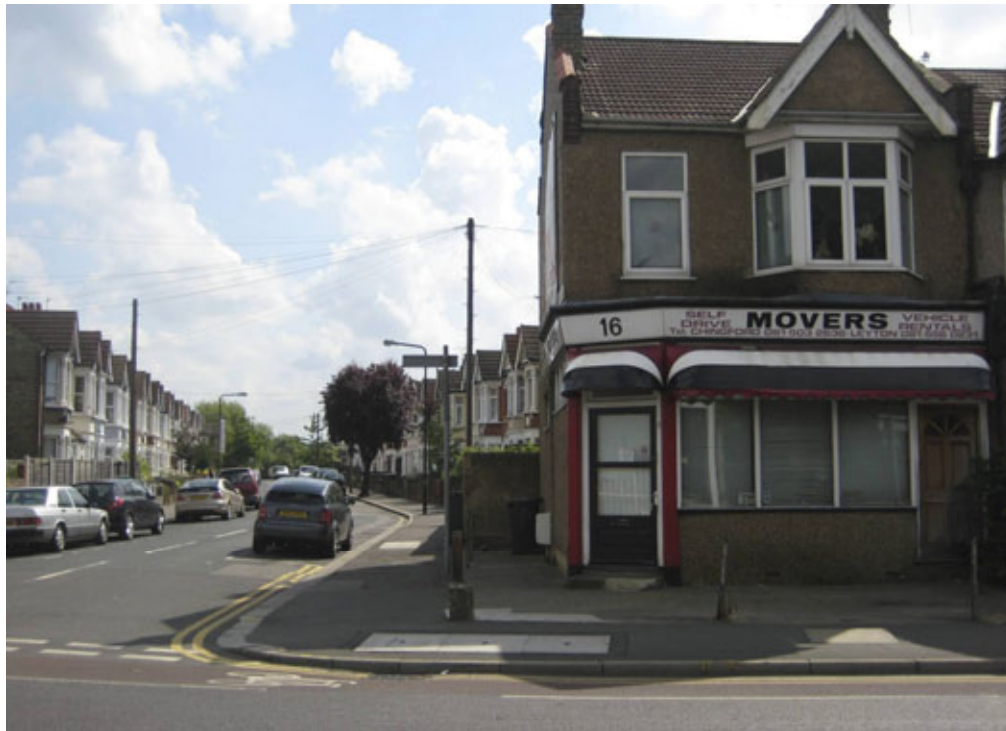
Above; local existing