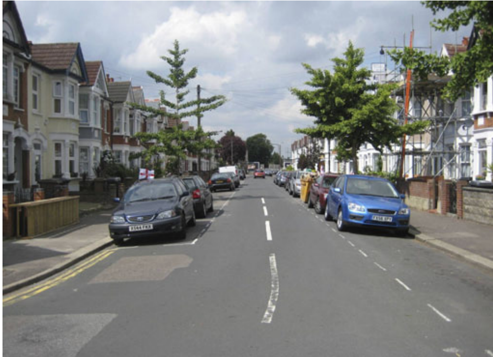
Above; Existing character of streets near the stadium

We have also added our own captions rather than the somewhat 'rose tinted' language used in the application descriptions.