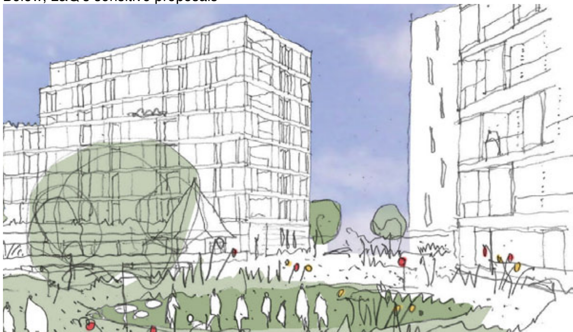
Below; L&Q's sensitive proposals