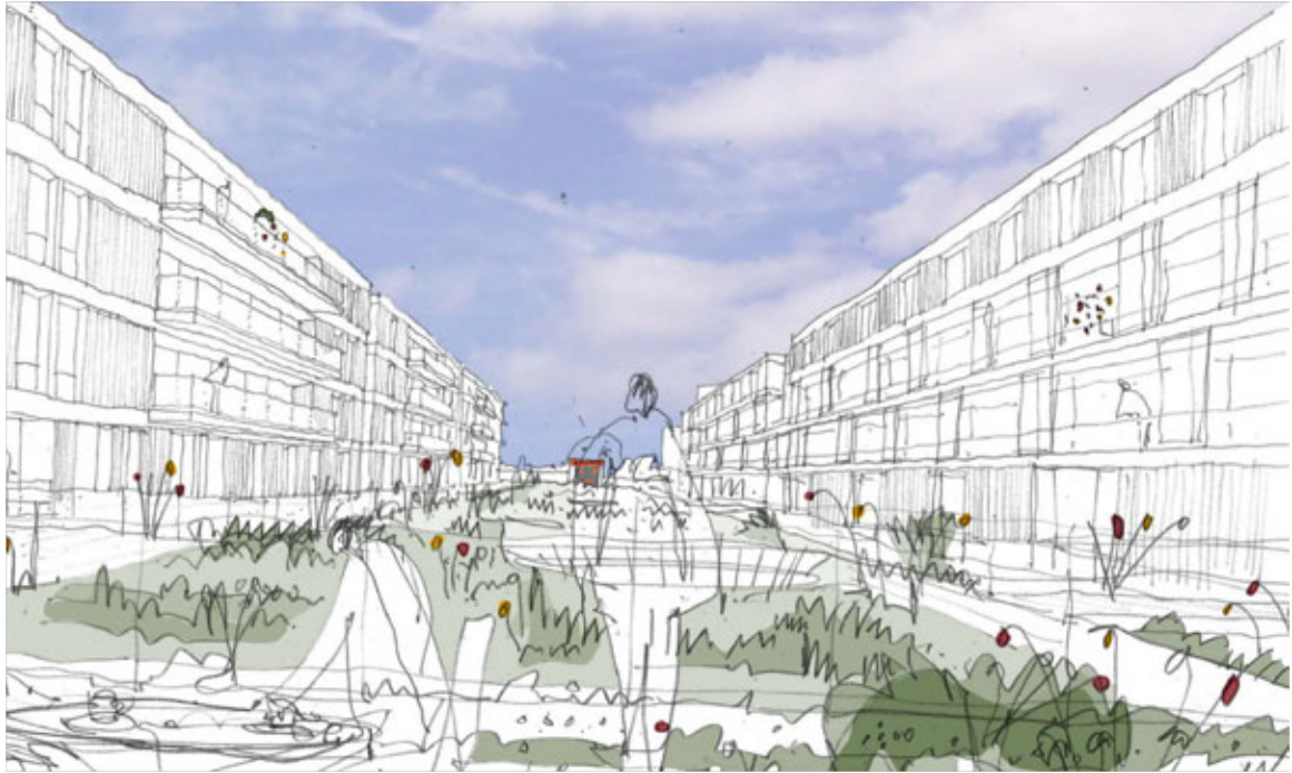
Monolithic slabs of four storey bland blocks And the same below but 3 storey