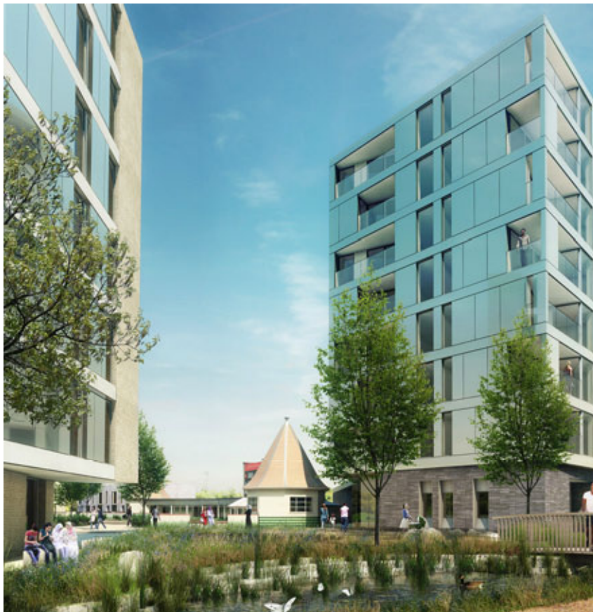
Below; what L&Q think is appropriate in this suburban setting!