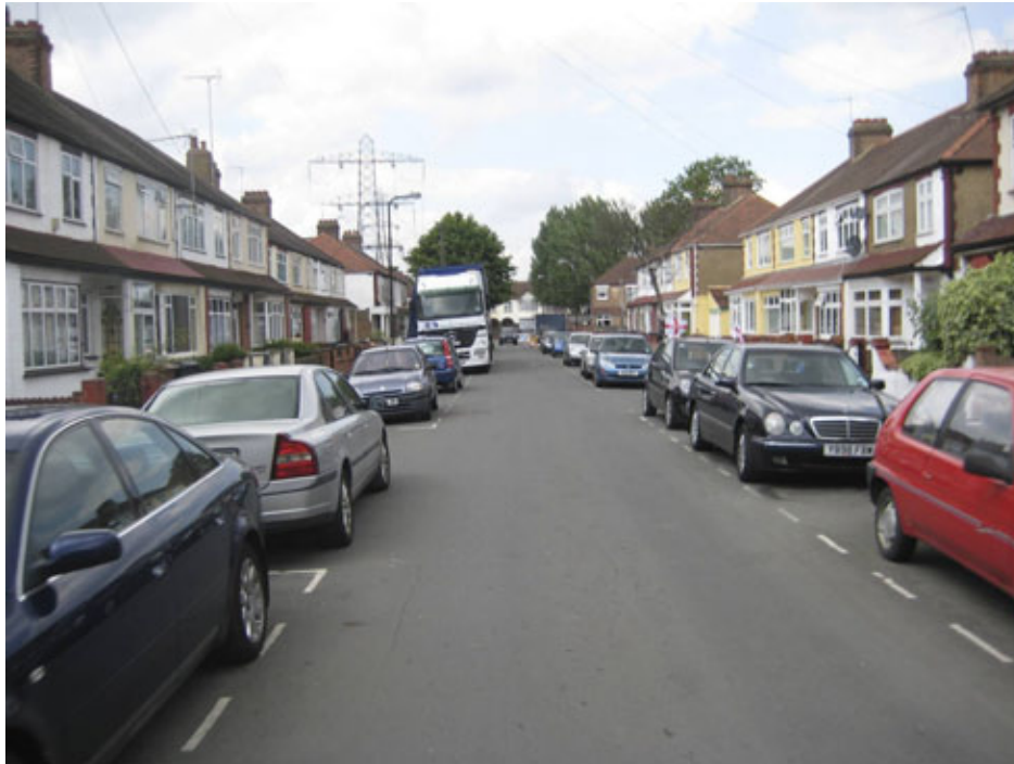
Above; low rise local context

Below; L&Q's 'vision' (which has the sun shining from the north in an attempt to brighten it up a bit...doesn't really does it?)