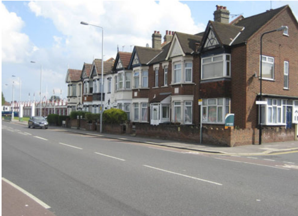
Above; another example of the local scale and character as existing